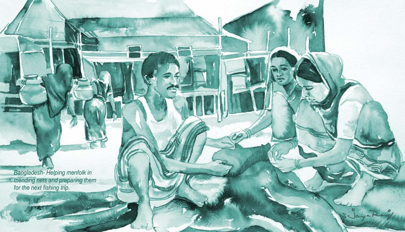
Bangladesh- Helping menfolk in mending nets and preparing them for the next fishing trip.