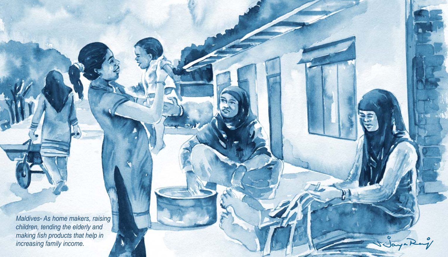
Maldives- As home makers, raising children, tending the elderly and making fish products that help in increasing family income.