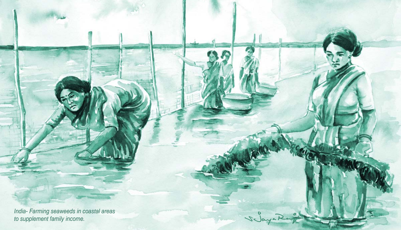
India- Farming seaweeds in coastal areas to supplement family income.