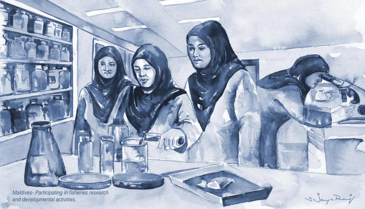
Maldives- Participating in fisheries research and developmental activities.