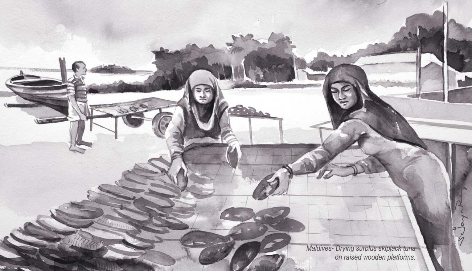
Maldives- Drying surplus skipjack tuna on raised wooden platforms.