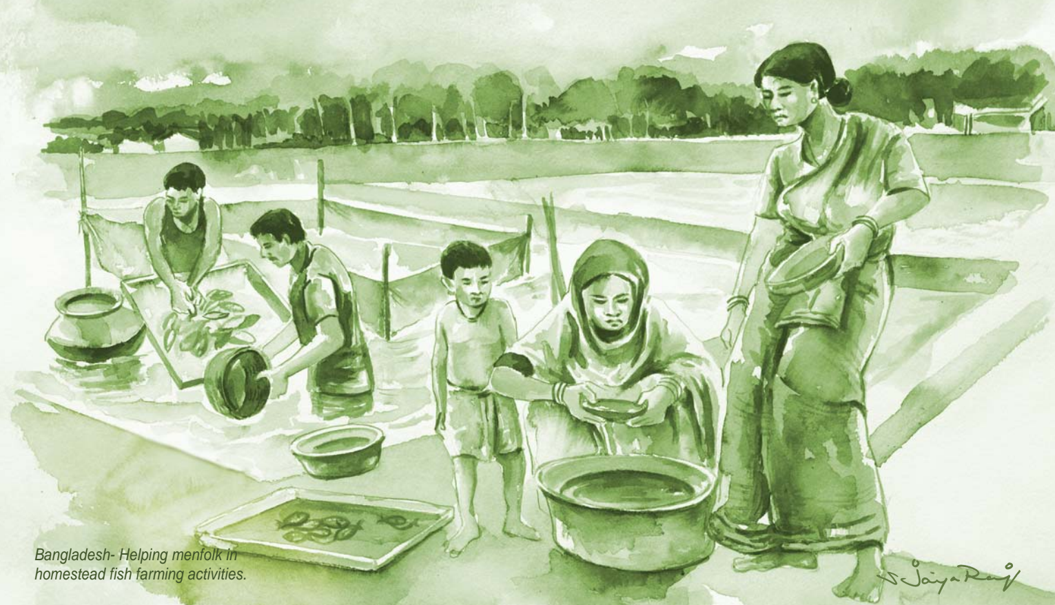
Bangladesh- Helping menfolk in homestead fish farming activities.