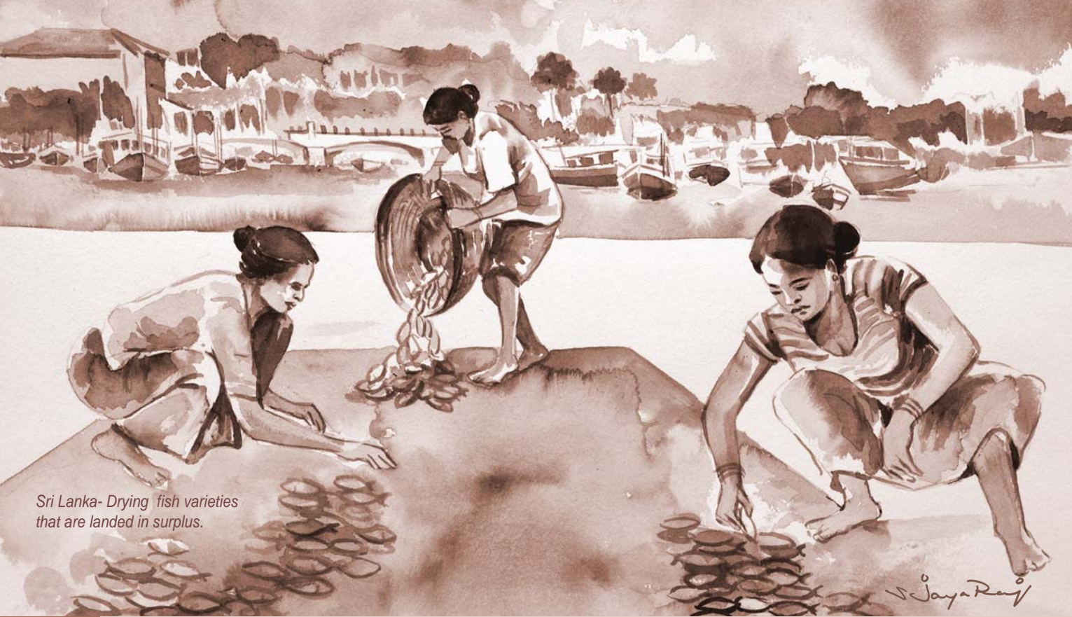
Sri Lanka- Drying fish varieties that are landed in surplus.