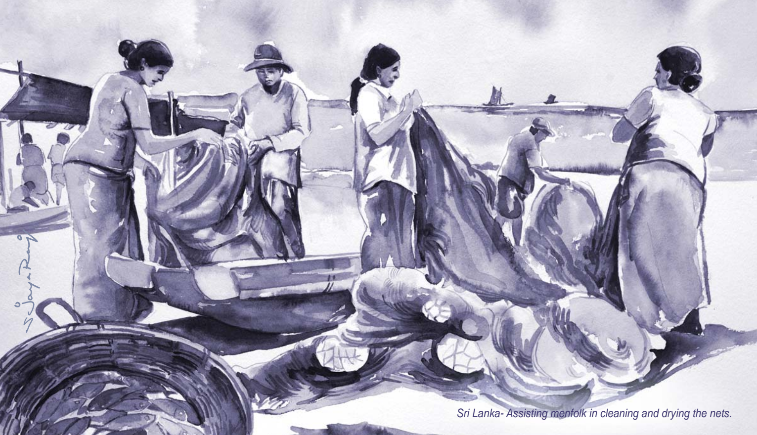
Sri Lanka- Assisting menfolk in cleaning and drying the nets.