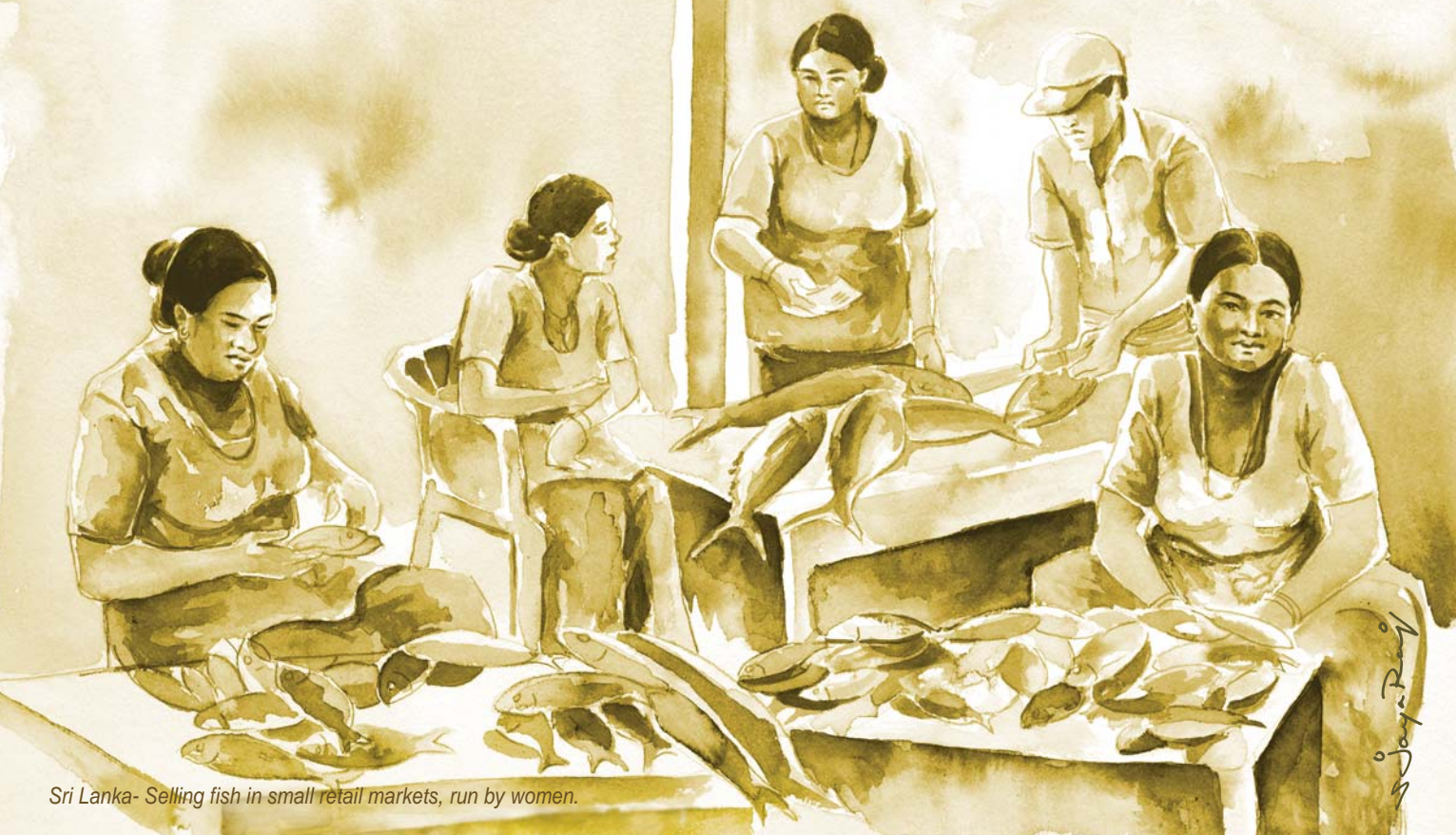
Sri Lanka- Selling fish in small retail markets, run by women.