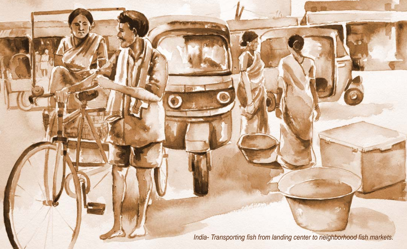
India- Transporting fish from landing center to neighborhood fish markets.