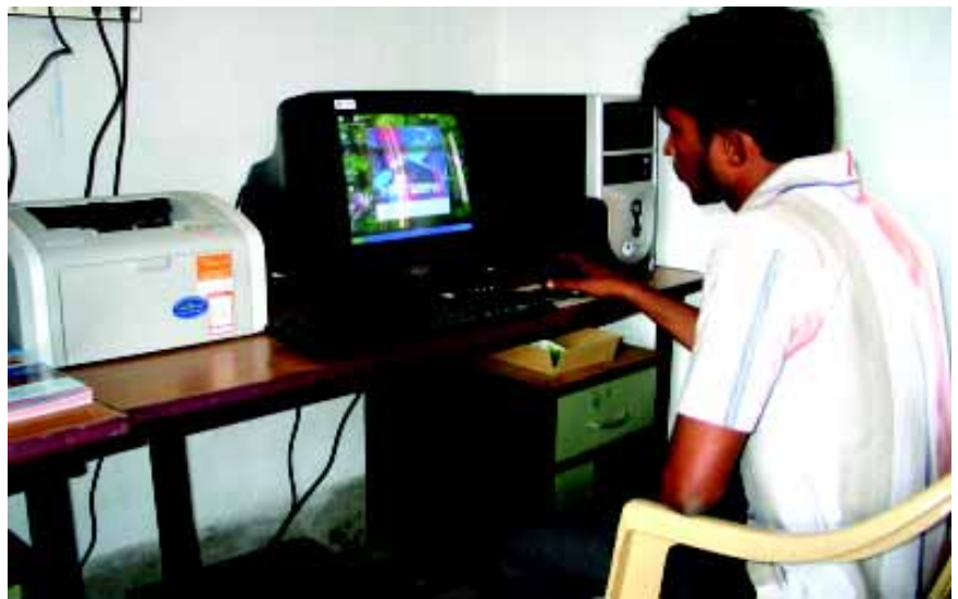
An IT kiosk set up in a fishing village to provide information on potential fishing zone and weather conditions.

Sixty four landing centres along the coast of Orissa cater to the needs of fishers belonging to 647 fishing villages. Mechanized fishing boats operate from 19 fish landing centres