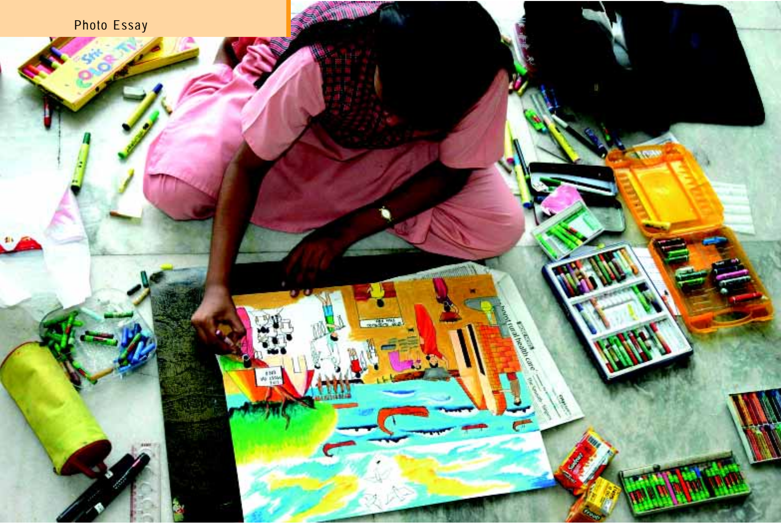
Two award winning young artists - above and below.