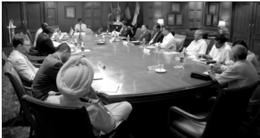
GCM in progress.