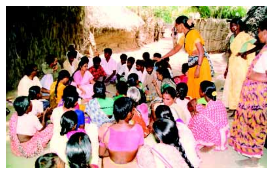
Interactive sessions help in identifying activities that can sustain the SHGs.

village, coastal Pondicherry); handicrafts (opportunities for business in shell craft and palmyra leaf craft exist throughout the coast. Fisherfolk could supply shells to factories that require lime.)